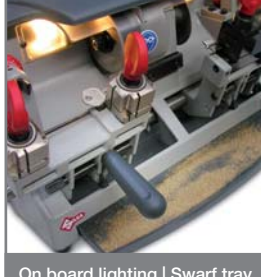
On board lighting | Swarf tray

The on-off switch features a safety cut-out for user protection. The machine needs to be